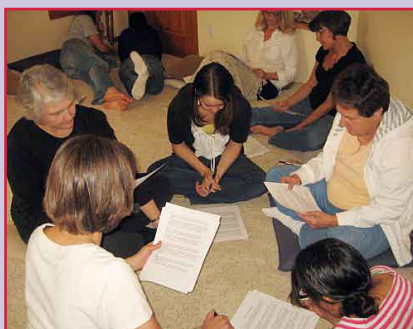
Young adults gather with Sisters of Charity in La Union, N.M., to share about the Enneagram, a tool for personal and spiritual growth.