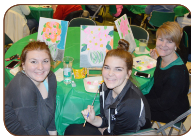
Seton recently hosted an Alumnae Painting Party for alums and their daughters.