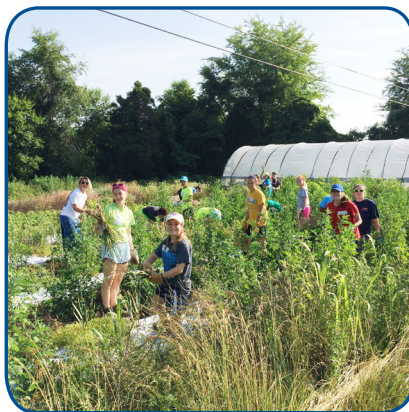
Seton High School students participated in a mission trip to Liberty, Kentucky, this past summer.

Seton High School which won a $25,000 grant from State Farm's Celebrate My Drive competition for the third consecutive year! Families, friends, and alumnae voted for Seton out of thousands of participating schools. Each year, Seton has given a portion of the award toward developing programs that teach safe driving habits. Seton continues its exceptional service learning program providing educational and fun experiences for Holy Family, Roberts and St. Lawrence schools. They also participate in three mission trips a year in Liberty, Kentucky, where they assist Amish and Mennonite families who do organic farming.