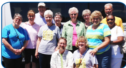
Faculty and staff of MSJU engaged in a pilgrimage/retreat to Emmitsburg, Maryland, in June.

Twenty Seton High School students and six chaperones recently returned from a mission trip to New Orleans. One student evaluated her experience: "This was my first time on a mission trip and I loved every part of it – whether we were exploring the city to learn about the culture of New Orleans, spending all day hard at work, or attending services at church. Doing all of this with my Seton sisters was a great bonding experience." This trip was part of a larger program that offers many Seton students the opportunity to provide community service locally, in other areas of the US and abroad. Besides assisting those in need, the students are also enabled to broaden their horizons through these experiences.