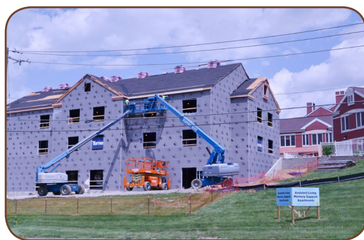
Bayley's new Assisted Living Memory Support Apartments are scheduled to be completed this fall.

This fall, Bayley will participate in the “Happening on the Hill” event on Sunday, Sept. 25. As part of Delhi Township's bicentennial celebration, Mount St. Joseph University, the Sisters of Charity Motherhouse and Bayley will open their doors to the public, showcasing what each offers to the community. Tours of our new addition, the Wellness Center and a Village cottage, entertainment and refreshments will be the order of the day. The corner of Delhi and Bender is ever changing, ever growing. Thanks to the Sisters of Charity's vision and insight, Bayley has become the place to meet your needs and your neighbors!