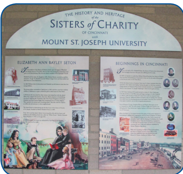
A panel from the Mount St. Joseph University Heritage Wall.

Mount St. Joseph University and this year's freshmen class, which will be the 100th anniversary graduating class in 2020. Preparations are underway to organize events for this anniversary.