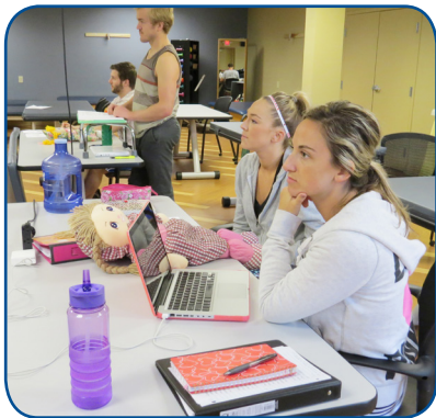
MSJU's Center for Health Sciences on Neeb Road opened this school year.

Mount Saint Joseph University where an open house was held on Aug. 19 at the new Center for Health Sciences on Neeb Road. The building was remodeled from physician offices to accommodate the Mount's programs in physical therapy, physician assistance, and nursing. Not all health classes will be held there but the building helps immensely.