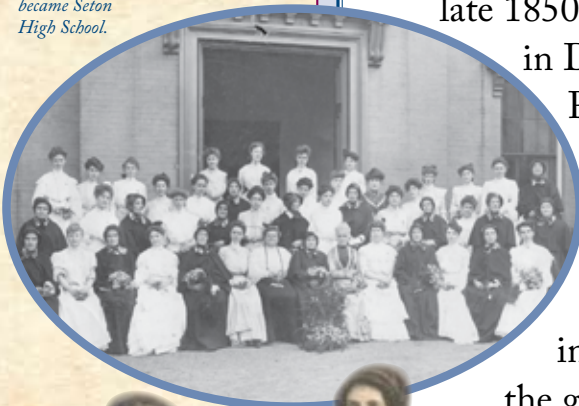
Mount St. Vincent Academy (Cedar Grove) in the Price Hill neighborhood of Cincinnati educated young women from 1857 to 1927 when the facility became Seton High School.