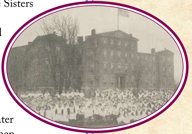
St. Joseph Orphanage, located in the Cumminsville neighborhood of Cincinnati, was home to thousands of children from 1855 to 1962 when it moved to a new facility in Monfort Heights.