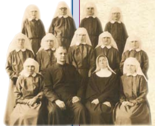
The Pious Union of Our Lady of Good Counsel was formed in 1924 at St. Rita School for the Deaf.

The Sisters and Daughters of Charity formed the Mother Seton Conference in 1947 to work for the canonization of their founder. Their efforts were rewarded when Elizabeth Seton was declared venerable by the Church in 1957 and beatified in 1963. In the 1950s a house of studies for temporary professed Sisters, part of the Church-wide Sister Formation movement, was established at the motherhouse to provide new members with an extensive spiritual and educational experience before beginning their ministries. This helped prepare the Congregation for the renewal that was to come.