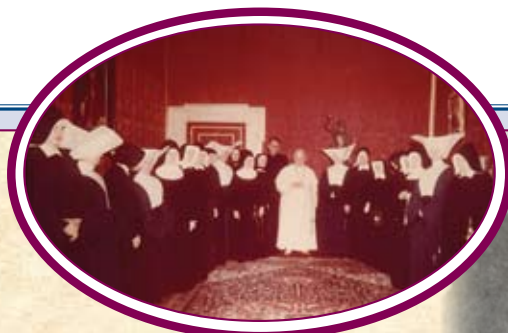
Members of the Mother Seton Conference, later called the Sisters of Charity Federation, meet with Pope John XXIII.