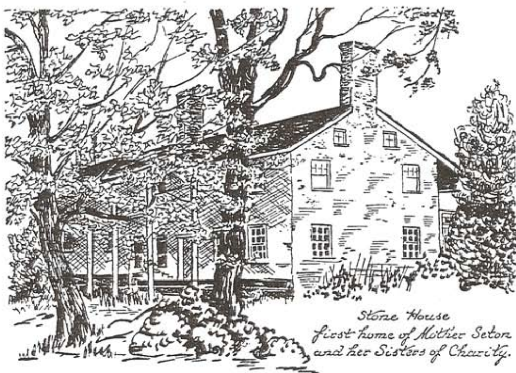
Stone House first home of Mother Seton and her Sisters of Charity.

STORY AND PICTURES BY A SISTER OF CHARITY