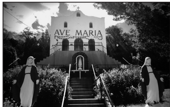
Ave Maria Shrine near Mount San Rafael Hospital.

1908 – After a statue of the Virgin Mary was discovered on a hillside near Mount San Rafael Hospital, the Sisters built a small grotto that developed into the Ave Maria Shrine.