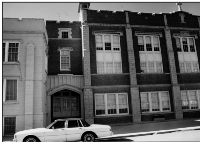
The new Holy Trinity High School was built in 1947.

1947 – A new Holy Trinity High School building was completed, followed in 1948 by a grandstand, and in 1958 by a new gymnasium.