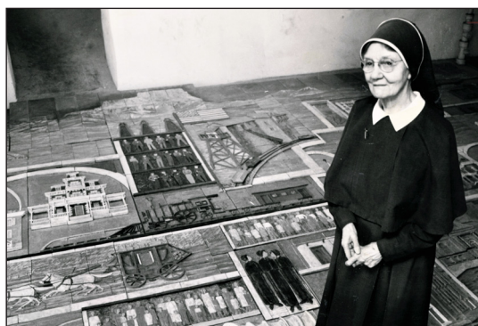
S. Augusta Zimmer created the 2,000-pound ceramic mural that hangs in the hospital's lobby.

1980 – After completing a fused glass window of the Burning Bush for the new Mount San Rafael Hospital, S. Augusta Zimmer was commissioned to create a ceramic mural depicting the history of Trinidad. Five years into the execution, the 12-foot-high, 28-foot-long mural was installed in the lobby of the hospital in 1980.